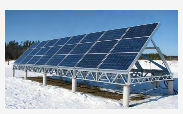
EverExceed PV modules offer BTS-leading performance for a variety of applications

Uses advanced surface texturing to improve efficiency